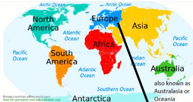
© www.countries-of-the-world.com Free for personal and educational use.